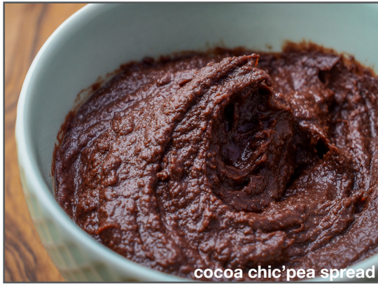
cocoa chic'pea spread